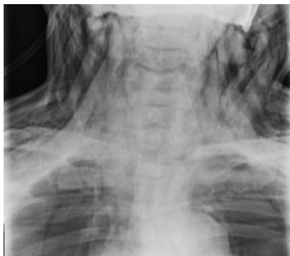
Figure 2a: Neck emphysema on neck radiograph