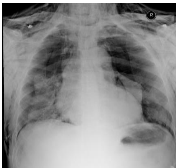
Figure 2b: There was bilateral tension pneumothoraces resulting compressive collapsed of the lung parenchymal. Pneumomediastinum and massive subcutaneous emphysema were also noted.

The patient was taken to the operating room for further evaluation and airway stabilization. Direct laryngoscopy revealed normal supraglottic structure with symmetrical vocal cord mobility. There was no oedema, hematoma or laceration at supraglottis, glottis and immediate subglottic region. Oropharyngeal intubation was